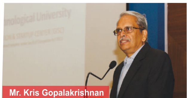
Mr. Kris Gopalakrishnan