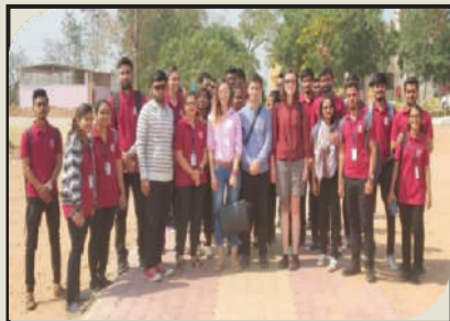
GSMS Students along with foreign students at Punsari Village