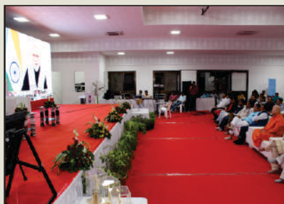
Address of Prime Minister during Smart India Hackathon 2019