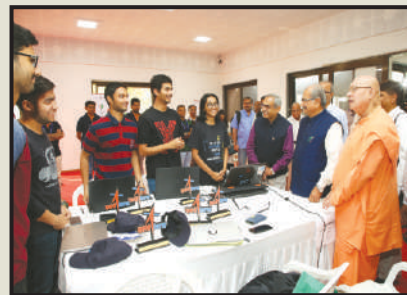
Participants interacting with dignitaries during SIH 2019