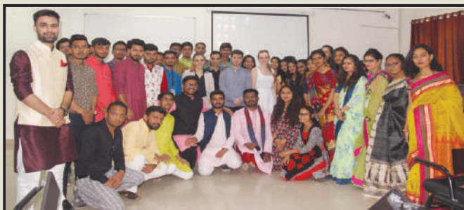
Traditional Day on 12 th February 2019