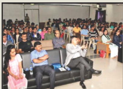
Participants during the event at GTU