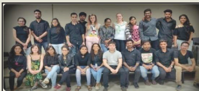
Black Day on 13 th February 2019