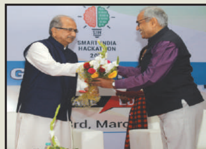
Felicitations of Education Minister by Vice Chancellor, GTU