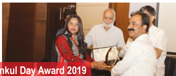
GIC Innovation Sankul Day Award 2019