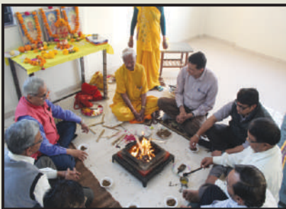
Havan at GTU Boys' Hostel on 25th January 2019