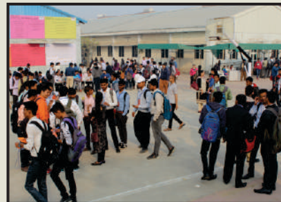
Placement Fair at GTU