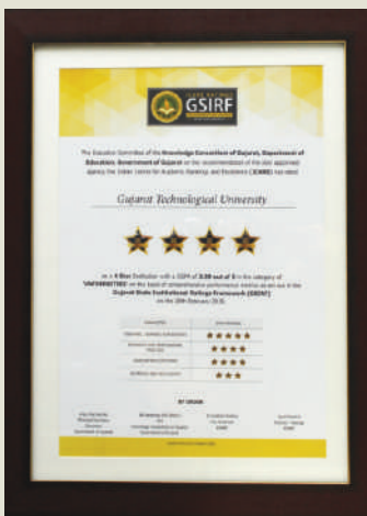
First Rank of GTU in GSIRF