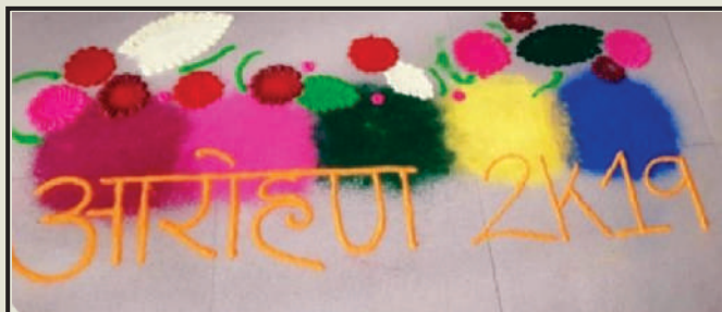
Sports Day 'Aarohan 2k19' on 1 st March, 2019