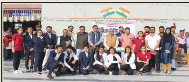
Republic Day Celebration on 26 th January 2019