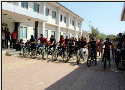
Sports Day Celebration at GSMS, GTU